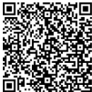
Chief Security Sign